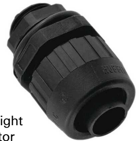
Straight Liquid-Tight Connector