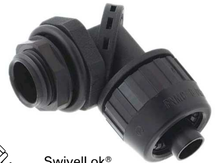
SwivelLok® Multi-Position (PS...NBK) Liquid-Tight Connector

Technical data and dimensions are subject to change without notice. Dimensions in inches (mm).