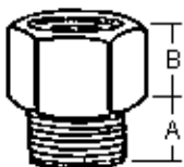
ME - Series