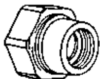
BR - Series