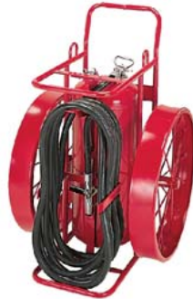
Models 573, 574, 575, 690 HIGH PERFORMANCE 125 / 250 lb. Dry Chemical