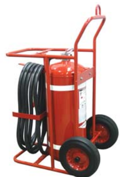
Models 673, 674, 675 65 lb. / 150 lb. Halotron I™