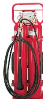
Model 333 50 lb. Carbon Dioxide Model 334 100 lb. Carbon Dioxide