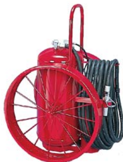
Model 630 33 gal. FFFP Foam