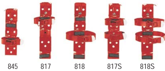
845 817 818 817S 818S