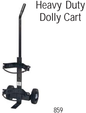
Heavy Duty Dolly Cart