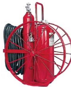
Models 470, 471, 472 125/150 lb. Dry Chemical