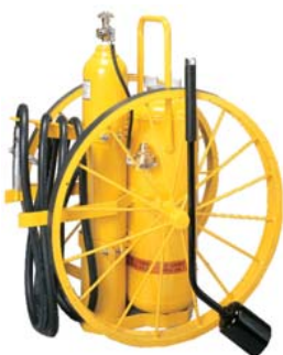
Model 680 150 lb. Sodium Chloride Model 681 250 lb. Copper