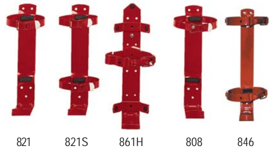
821 821S 861H 808 846