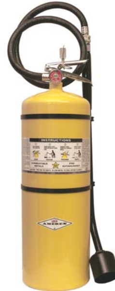
MODELS B570 B571