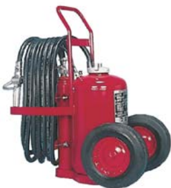
Models 450, 451, 452 125/150 lb. Dry Chemical