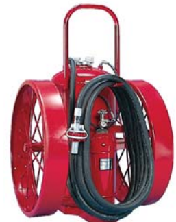
Models 491, 492, 493 300/350 lb. Dry Chemical