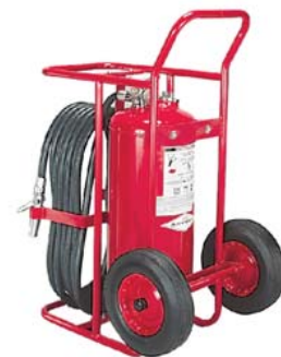
Models 488, 489, 490 125/150 lb. Dry Chemical