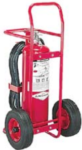
Models 495, 496, 497 50 lb. Dry Chemical