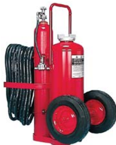
Models 467, 468, 469 125/150 lb. Dry Chemical