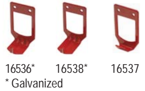
16536* 16538* 16537 * Galvanized