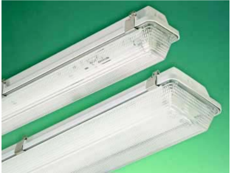
F9904/NS/WP - 1x36W Viking F9905/NS/WP - 2x36W Viking

Suitable for interior and exterior applications, protected to IP65.