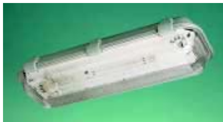
F9901/NS/WP - 1x24W Neptune