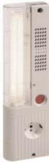
Photo: Slimline lamp with on/off switch, with integrated electric socket (Germany), Art. No. 02520.0-00