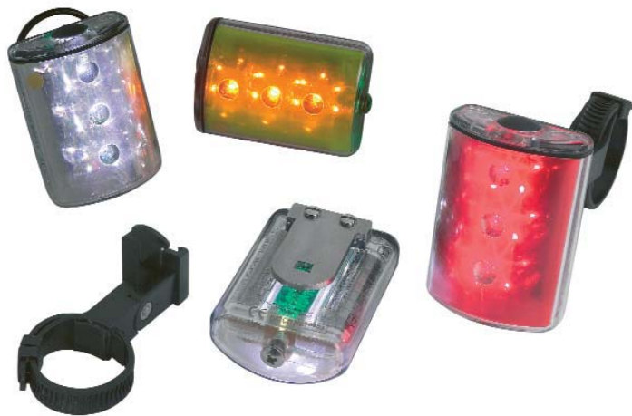
LiteTracker LT-131 and Bikelite LT-131B LED medium angle beam (approx 15°) Peak luminous intensity at 1m 14 lux , at 2.5m 2 lux