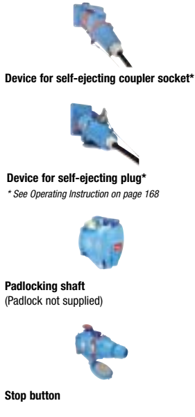
Device for self-ejecting coupler socket*