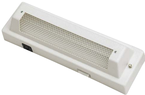
Half cut-out lens shown